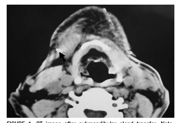
FIGURE 1. CT image after submandibular gland transfer. Note the high-density image in the posterior border of the gland.

The posterior and inferior borders were marked with titanium miniclips to help identify the gland during RT planning.