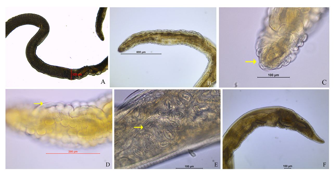
Fig. 2. Morphologic features of Gongylonema pulchrum : (A) Body length of 35 mm and width of 0.3 mm; (B) anterior end; (C) mouth opening (arrow, original magnification ×200); (D) cuticular interstrial ridges in the anterior part of the body (arrow, ×200); (E) eggs in the vagina (arrow); (F) posterior end (arrow).

The specimen was transferred to the Department of Microbiology and Parasitology, Peking Union Medical College, for identification. It was a nematode of thread-like form and was coiled while soaked in 75% alcohol. It was approximately 35 mm in length and approximately 0.3 mm in width. The anterior end was covered by numerous round or oval cuticular thickenings. The uterine branches joined with the vagina near the middle of the body, and eggs were found in the vagina. There was a conical and obtuse tail at the posterior end. The morphologic characteristics (size, color, shape, microscopic features of the mouth opening, anterior end, and internal structure) enabled eventual identification of the specimen as an adult female G. pulchrum <sup>13,14</sup> (Figure 2).