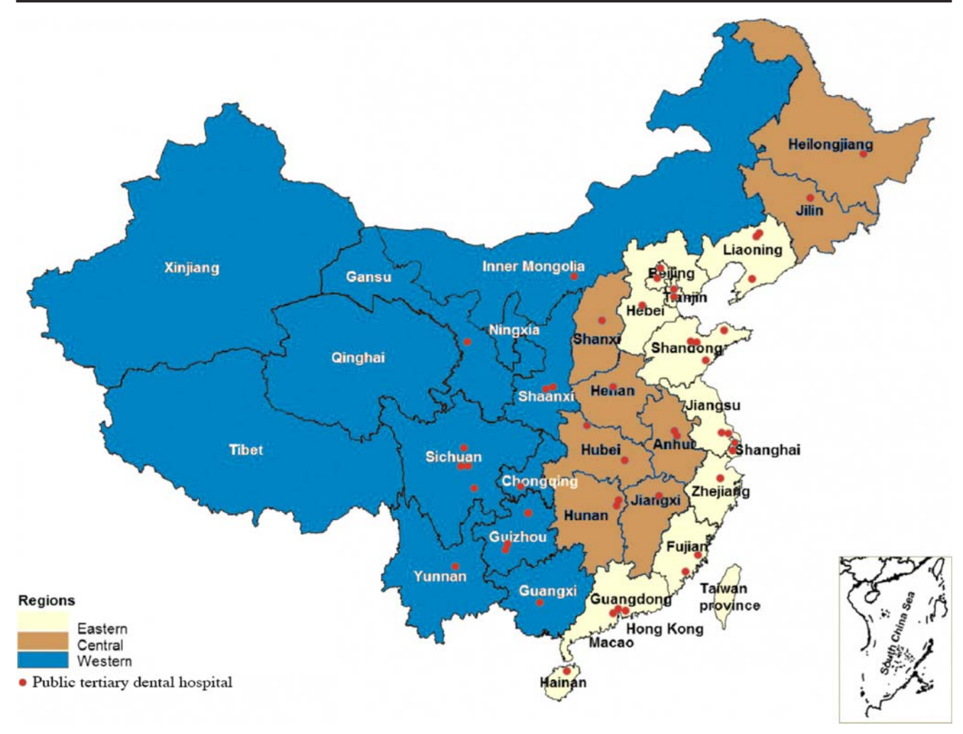
Fig. 1 Hospitals' geographical distribution and categorization. The red point represented 48 public tertiary dental hospitals in China mainland

in future dental care. However, there should be further studies about the long-term socioeconomic, psychological, or