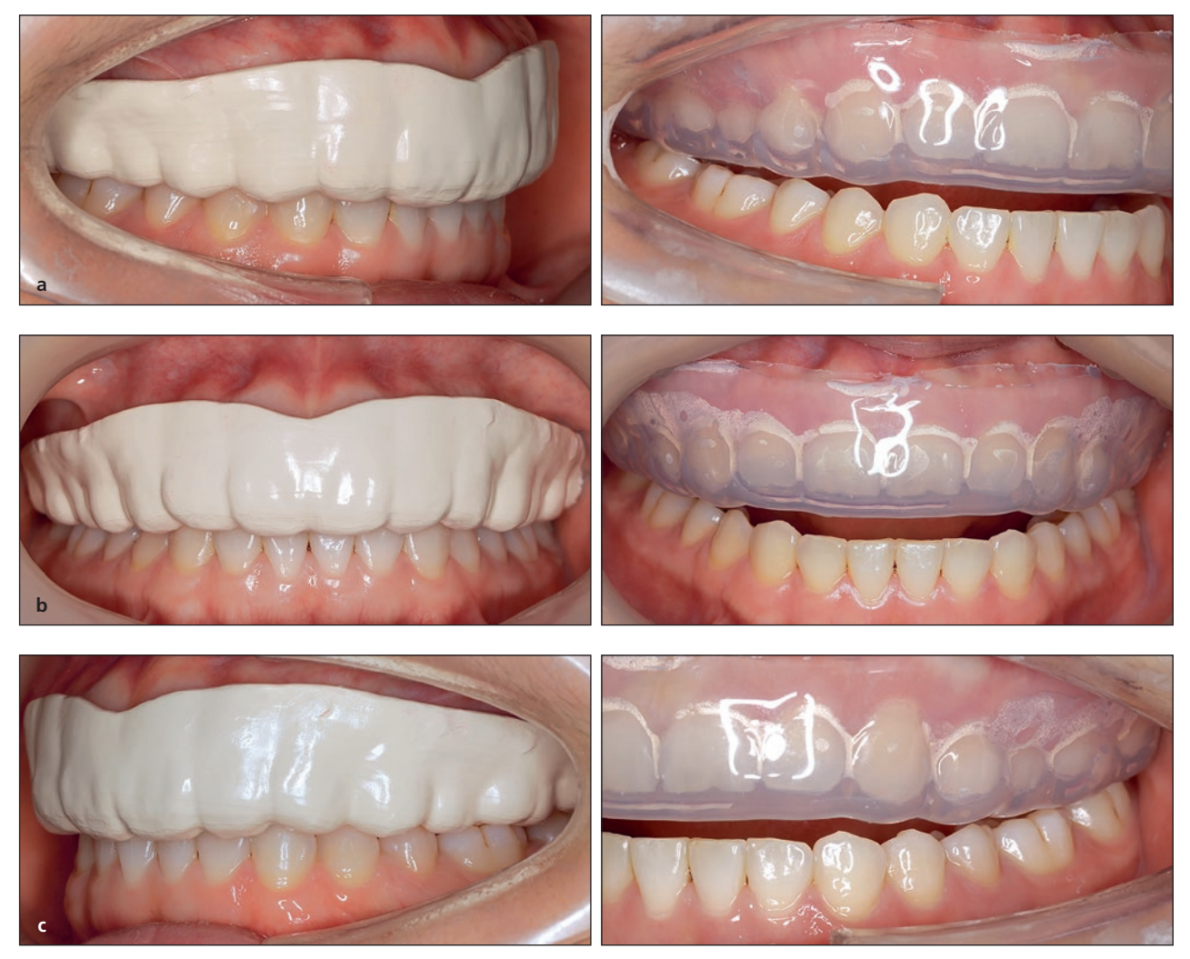
Fig 2 Digital (top) and conventional (bottom) mouthguards were tried-in under (a) right-side occlusion, (b) centric occlusion, and (c) left-side occlusion.

the mouthguards were adjusted to ensure there was no occlusal interference (Fig 1b). The STL file was sent to the dental laboratory and imported into the CAD/CAM system (Organical Multi S & Changer 20 and Organical Mill 2, Organical CAD/CAM). Based on the authors' previous research on characteristics of the material, PEEK trays were milled to obtain digital mouthguards.<sup>9</sup>